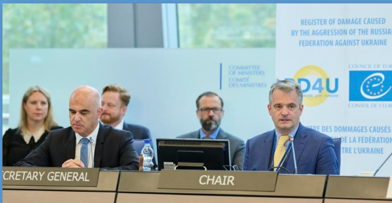
Fifth Meeting of the Conference of Participants of the Register of Damage for Ukraine Strasbourg, 11 October 2024