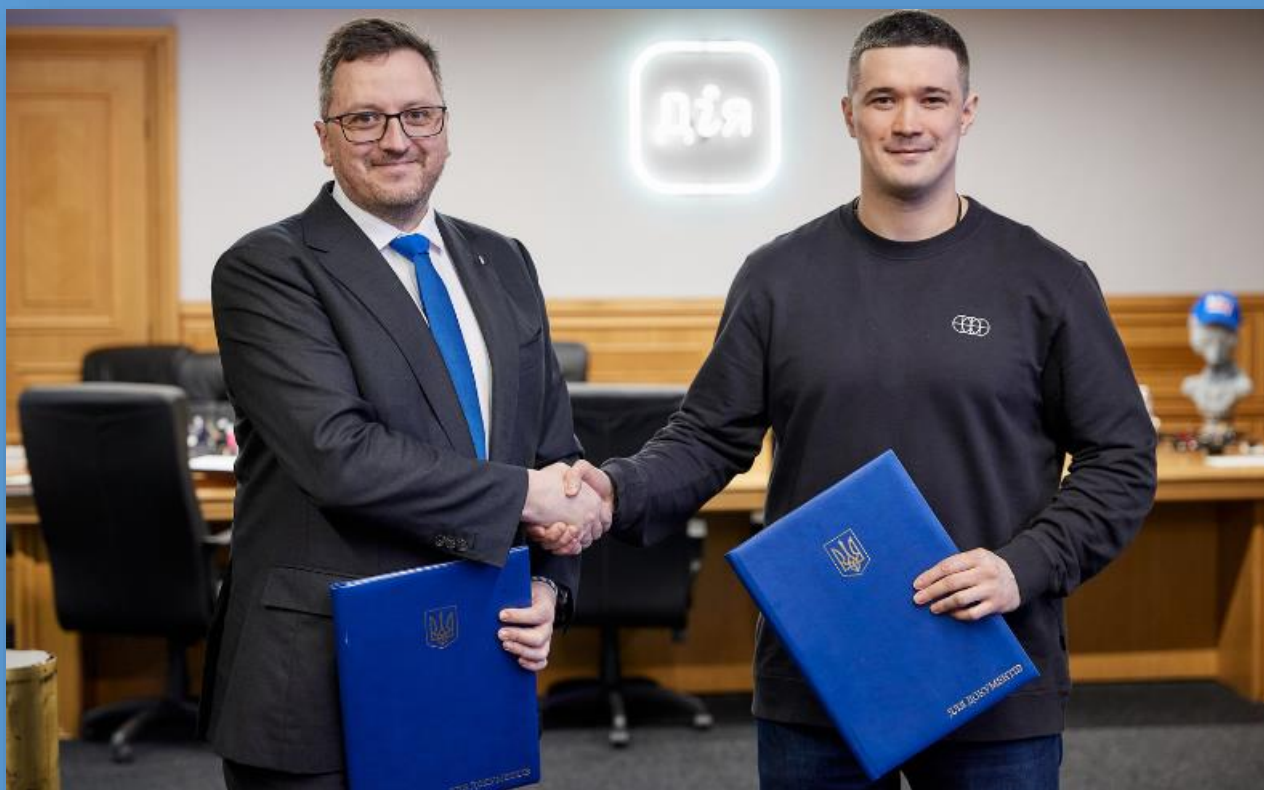
Signing of the Agreement on Electronic Data Exchange between the Register of Damage for Ukraine and the Government of Ukraine, Markiyan Kliuchkovskiy, Executive Director of RD4U and Mykhailo Fedorov, Vice Prime Minister of Ukraine, Kyiv, 25 March 2024