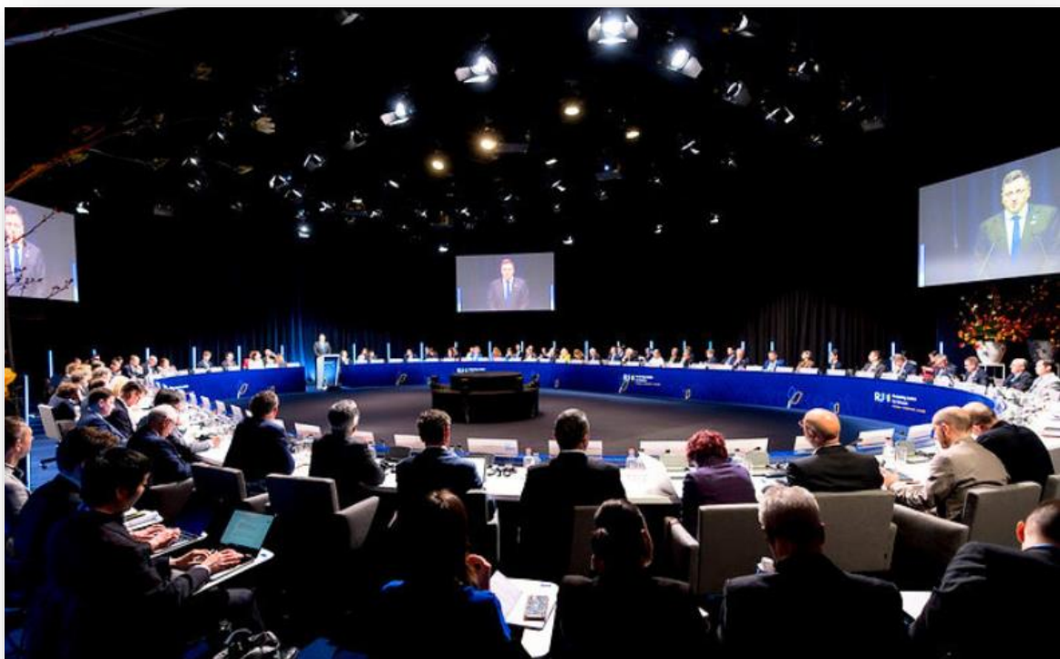
Fourth Meeting of the Conference of Participants of the Register of Damage for Ukraine, held on 2 April 2024 in The Hague as part of the Ministerial Conference on “Restoring Justice for Ukraine”

The Register also established its satellite office in Kyiv, Ukraine, which was formally inaugurated in March 2024 in the presence of the Secretary General of the Council of Europe, Marija Pejčinović Burić, the President of the Committee of Ministers and Minister of Foreign Affairs, Education, and Sport of Liechtenstein, Dominique Hasler, and the Minister of Justice of Ukraine, Denis Malyska. In addition to liaising with the Government of Ukraine, the Kyiv Office is raising awareness among various stakeholders within Ukraine – including potential claimants, businesses, civil society organisations, and the general public – about the Register’s work and the procedure for filing a claim to the Register.