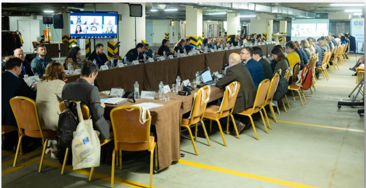
First Working Meeting of the Civil Society Coordination Platform of the Register of Damage for Ukraine, Kyiv & Online, 16 December 2024

Following this successful launch, the first working meeting of the Platform was held on 16 December 2024, bringing together representatives from more than 40 organisations to discuss ways of enhancing active collaboration with the Platform and to answer practical questions concerning the submission of claims