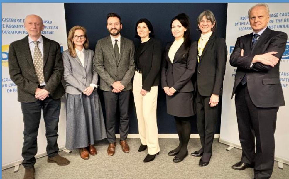
Second Meeting of the Board of the Register of Damage for Ukraine The Hague, 27 February – 1 March 2024